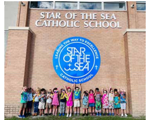
Our Early Learners on Hawaiian Dress Down Day

Star of the Sea Catholic School is rooted in the rich traditions of our Catholic faith to provide a Christ-centered learning environment where students are dedicated to spiritual growth, academic distinction, and social responsibility. #CDRCatholicSchools #DiscovertheDifference