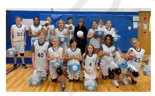
Star of the Sea Volleyball Team

Tournament; won their 1st Round match at Home (making them undefeated at Home!); and went on to the 2nd Round, losing to the team that won