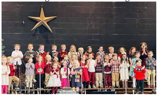
Kindergarten Carol Morning Performance